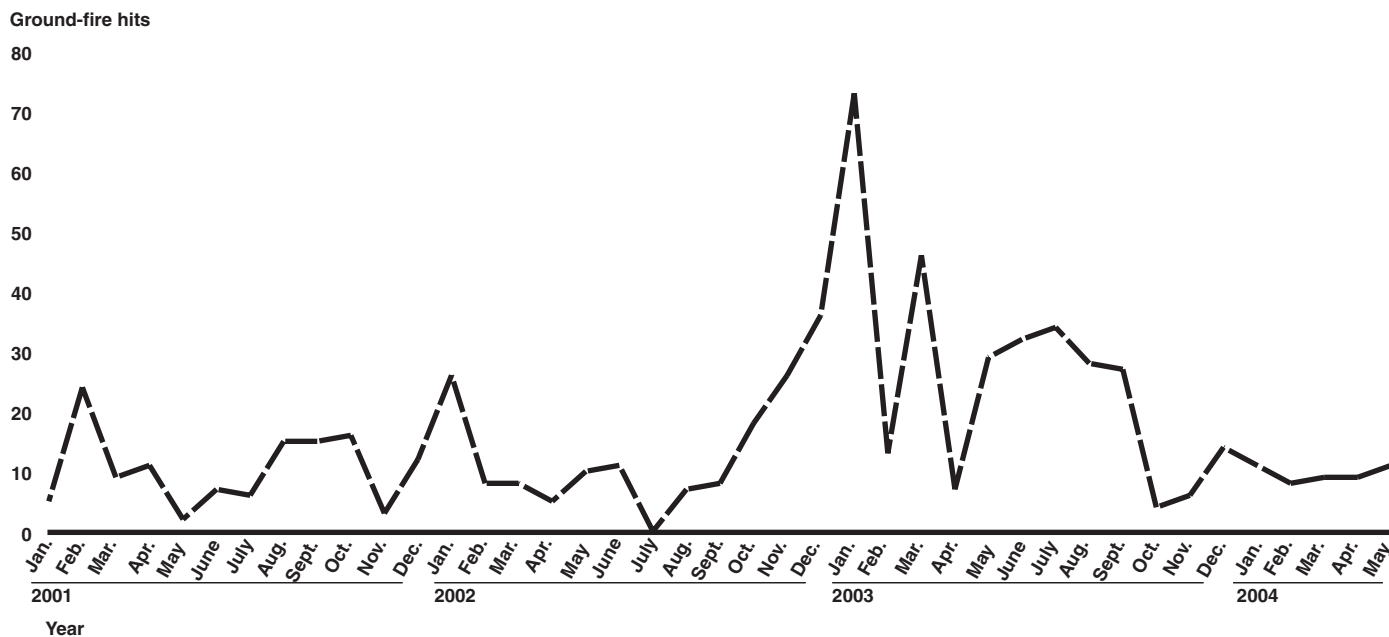
Figure 2: Number of Ground-Fire Hits Incurred by Spray Aircraft per Month, January 2001 through May 2004