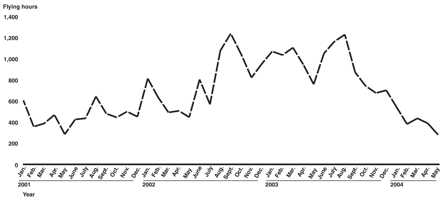
Figure 3: Number of Flying Hours by Spray Aircraft Per Month, January 2001 through May 2004