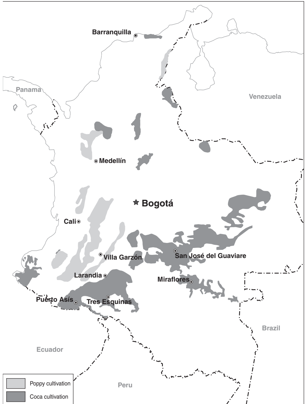
Figure 1: Coca- and Poppy-Growing Areas in Colombia, 2003