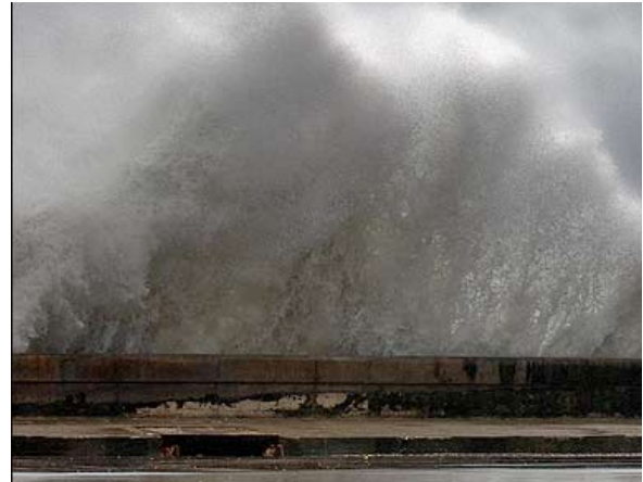
The storm surge from Hurricane Ike bursts over Havana's famed malecon (seawall)

As explained by hospital personnel, the main function of Operation Miracle is to provide eye surgeries (e.g. cataract and refractory) to patients throughout Latin America at no cost. Surgeries are conducted mainly by Cuban medical personnel who also provide training and logistical support. The results of the program are rather auspicious, as 1.5 million patients have been operated on in 35 countries, including 40,619 patients in four-and-one-half years at the Enrique Cabrera hospital alone. To date, 62 eye-care clinics have been established across the region while Cuba has secured medical cooperation with 103 countries with the participation of 185,000 medical professionals, including 42 hospital personnel operating in 8 countries. In turn, the hospital functions as a vital component of Cuba's disaster relief apparatus.