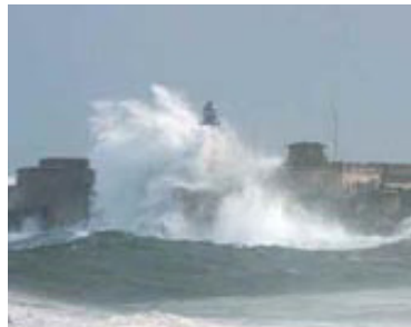
The storm surge from Hurricane Ike bursts against "El Morro", the famous castle in Havana constructed during the Spanish Colonial era.

targets deemed vital. Accordingly, municipal leaders use this data to better coordinate relief efforts through targeting vulnerable citizens and housing structures. Through gathering such detailed information, authorities are quickly able to determine, in advance of the storm, precisely which citizens require special assistance versus those who simply need assistance in securing personal property.