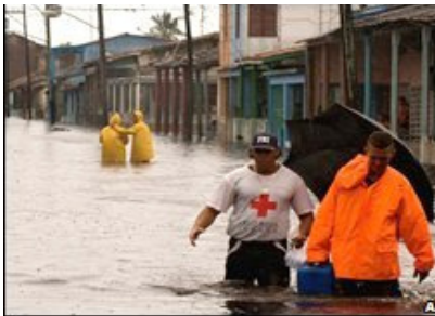
Rescue workers respond immediately in helping citizens evacuate after a hurricane.

Hurricanes are endemic to Cuba's history. The island's location between the US Gulf Coast and Windward Islands puts it in the path of devastating and frequent hurricane strikes. In particular, the date November 9, 1932, still resonates in the minds of many Cubans, as perhaps the country's most destructive storm (until then) struck the island near Camagüey, with wind speeds of 155 MPH and massive tidal waves. The aftermath of the storm was staggering, with nearly $40 million in property damage and over 3,000 casualties, considerably more than a 1926 storm that struck Havana and killed nearly 600 people. The revolutionary government, in its incipient years of existence, began to reform the country's disaster management apparatus, shifting the focus to its present goals of saving lives and protecting property.