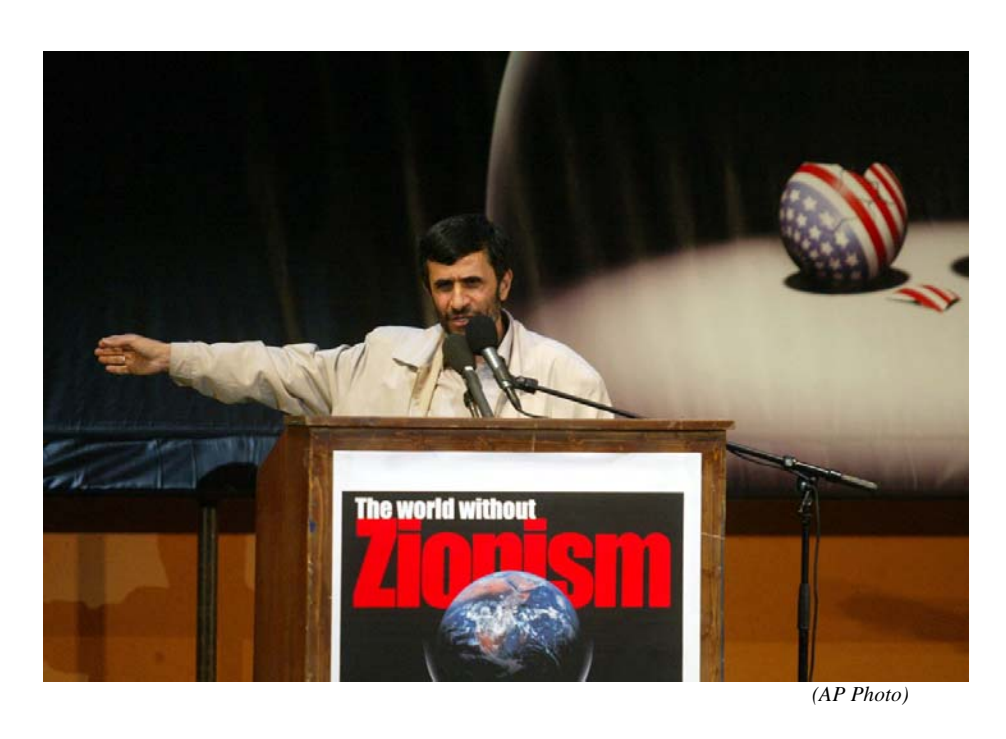
Staff Report of the House Permanent Select Committee on Intelligence Subcommittee on Intelligence Policy August 23, 2006