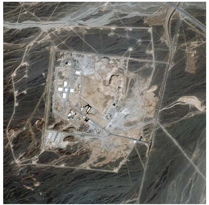
Iran is currently enriching uranium to weapons grade using a 164-machine centrifuge cascade at this facility in Natanz. Iran claims it will have 3,000 centrifuges at this site by next spring.